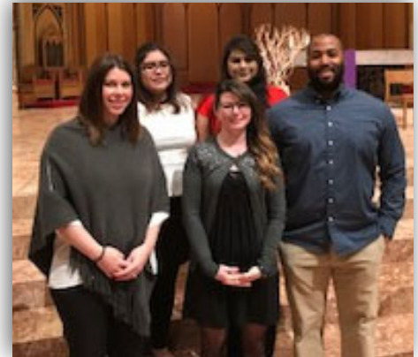
The following candidates celebrated this Rite:

Blessed Be God! O, Blessed Be God! Who Calls you by name! Holy and chosen one!