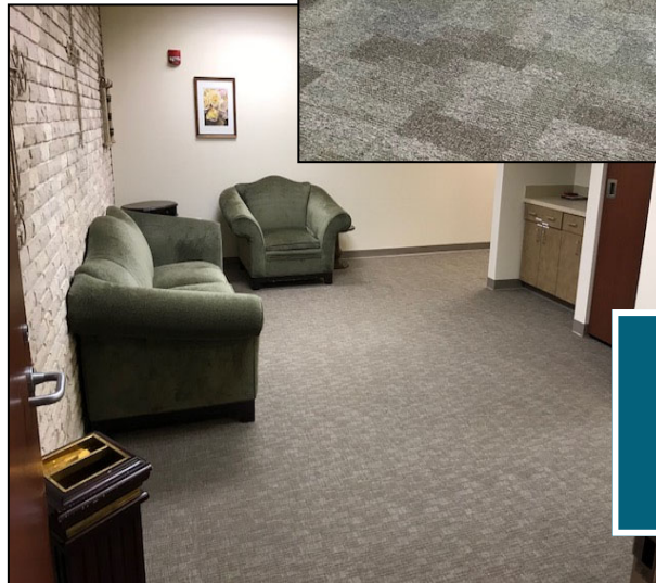
Brides' / Ushers' Room